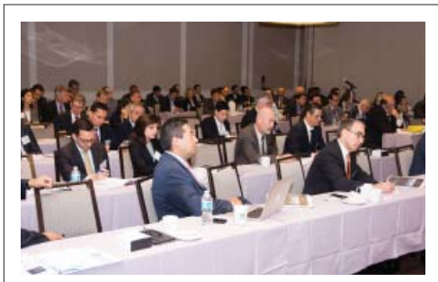
3rd IEL-ANADE Conference

The new Mexican energy legal framework is largely in place, and implementation is underway. The four-part first upstream bid round is near completion, the fuels market is open to competition, the gas and power market rules are set and power auctions are ongoing.